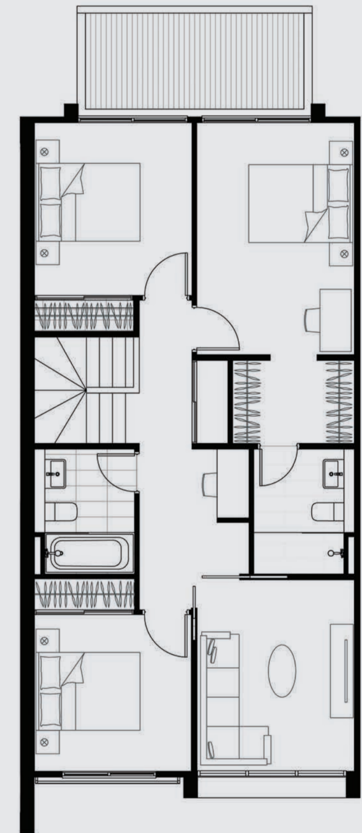
FIRST FLOOR (3 BEDROOM + MPR OPTION)